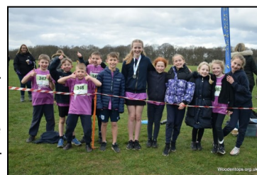
West Yorkshire Cross Country Finalists

17 pupils from Rowley Lane were selected for the final, a team of year 3 boys; a team of year 4 girls, an individual girl in Year 5 and an individual boy in Year 6. We are delighted to announce that our Year 3 boys team came 2nd overall and our Year 5 girl runner came 2nd overall and earned a place in the national finals. Well done to all of our pupils who represented school this term in sporting events. We are also really pleased that the school games organisers have decided to re-schedule the Kirklees Final that was thwarted by the weather. This will now take place on Tuesday 3rd May and all pupils who were due to run in the original event will be invited; unfortunately there will be no pathway through to the next level however, we know that all the pupils will still gain a lot of enjoyment from taking part in the event.